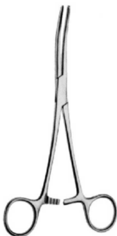
HB 0551 Rochester-Pean hemostatic forceps, curved, 14cm, 5 1/2"