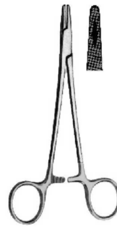
HB 2331 Mayo-Hegar needle holder, straight, 16cm, 6 1/4"