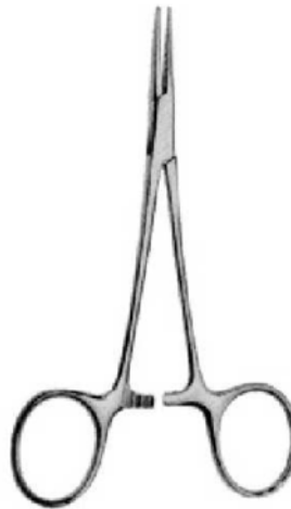
HB 0510 Halsted-Mosquito hemostatic forceps, straight, 12,5cm, 5"