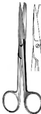
HB 1714 Operating scissors Standard, straight, Fig.2, 14,5cm, 5 3/4"