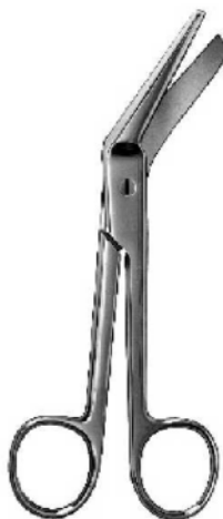
HB 1910 Braun-Stadler perineum scissors, 14,5cm, 5 3/4"