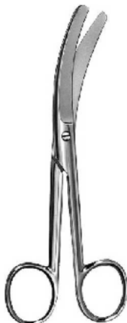
HB 1914 Busch umbilical scissors, 16cm, 6 1/4"