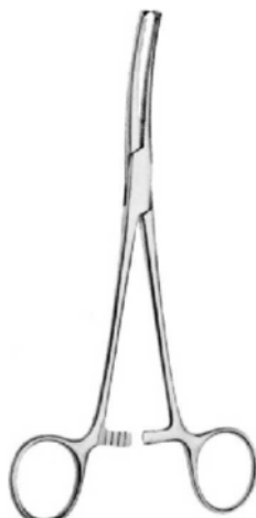
HB 0581 Ochsner-Kocher hemostatic forceps, curved, 14cm, 5 1/2"