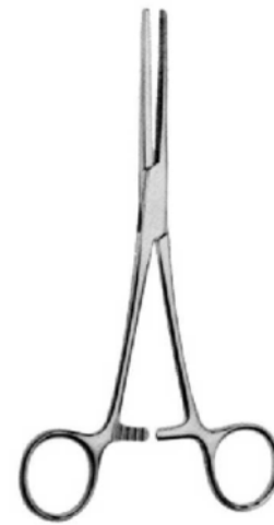
HB 0541 Rochester-Pean hemostatic forceps, straight, 14cm, 5 1/2"